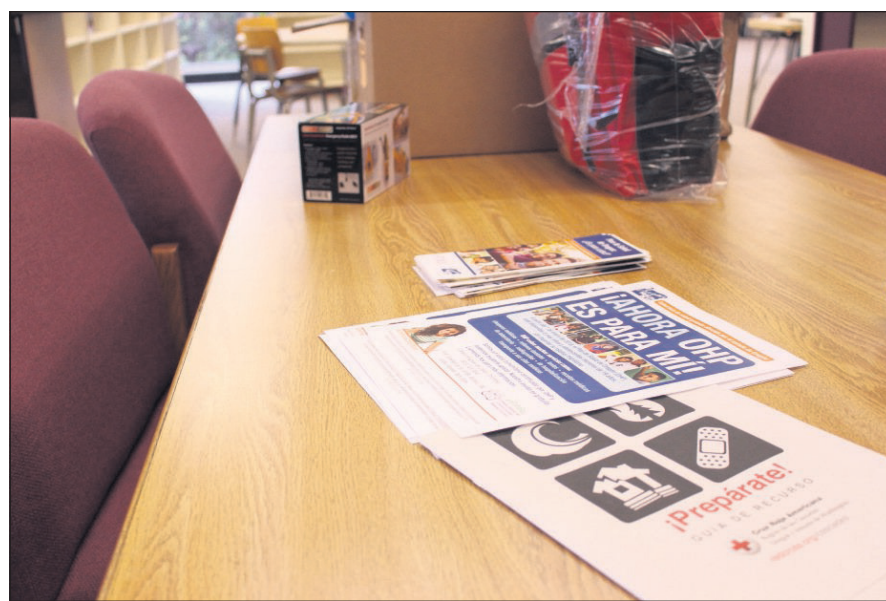
Preparedness literature sits on a table during a Spanish-only presentation about the Cascadia earthquake.