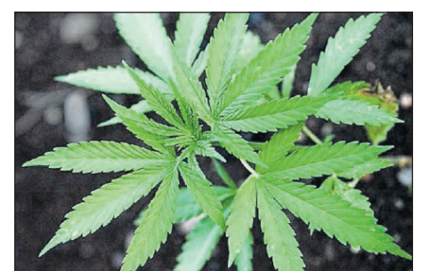
Pamplin Media Group

The Oregon Liquor Control Commission says with thousands of marijuana licenses and worker permits to renew and a steady stream of new applications that it is falling behind.