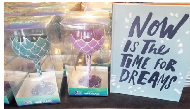
Mermaid Dreams stemware at Westport Winery Seaside