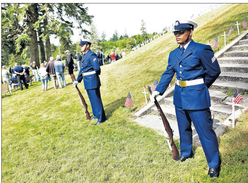
Members of the Coast Guard color guard stand at attention during the Memorial Day event.

For others, the day was about one veteran in particular. In the front row reserved for those who had lost someone in the line of duty sat the