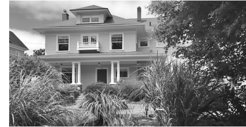
ONE OF ASTORIA'S FINEST 1656 Irving Avenue, Astoria • $899,000

Waiting for a spectacular home with an equally spectacular view of the Mighty Columbia River, Young's Bay AND Saddle Mountain? This fabulous contemporary-style, split-level home has been beautifully renovated and is in move-in ready condition. Large, open main level floor plan is perfect for entertaining and includes large living and dining room with fireplace and high ceilings, a light-filled kitchen, spacious master suite with private bath and large walk in closet and second full bath, and a private south-facing deck. The lower level features a large family room, two bedrooms and a third full bath. The oversized garage will fit two cars and toys.