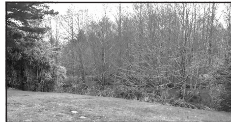
FORT STEVENS BUILDING SITE Quinnat adjacent, Hammond • $20,000

This building site has Mill Pond frontage and features views of the Pond, Village, Columbia River and Astoria Riverwalk. The site will require construction of a residence that is partially elevated over the water with pilings. Enjoy life on Astoria's waterfront