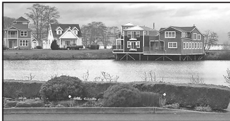
MILL POND WATER FRONT LOT Lot 12 Mill Pond Village, Astoria • $39,950

This building site has Mill Pond frontage and features views of the Pond, Village, Columbia River and Astoria Riverwalk. The site will require construction of a residence that is partially elevated over the water with pilings. Enjoy life on Astoria's waterfront.