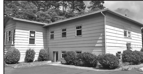
GREAT COMMERCIAL OPPORTUNITY 701 W. Marine Drive, Astoria • $349,000

This beautifully renovated two-level, light-filled home with nearly 2,800 square feet of fine living space is situated on a private 5 acre Columbia River and estuary waterfront site and includes an additional 3.9 acre waterfront parcel. A truly one of a kind home, this impressive property offers an extraordinary view of the Columbia River, Washington Coastline and estuary. A large shop building adjoins the property. Great gardening space. Time to pack!