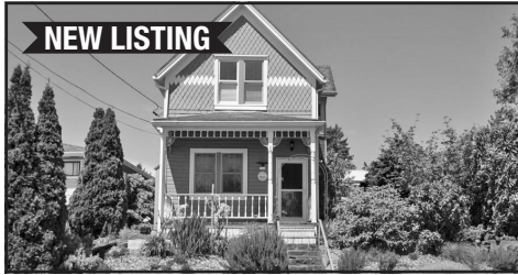
NEW LISTING FABULOUS PAINTED LADY 566 Olney Ave., Astoria • $339,000

This exceptional example of Astoria's treasured Victorians offers both a sense of history and a thoughtful renovation that merges the best of both old and new. Lovingly restored, this 2 bedroom, 2 bathroom home features a large living room and formal dining room with high ceilings and gracious ambiance. The kitchen is charming with modern utility. Spacious shop and loads of off street parking. Lovely, well-maintained yard and garden area.