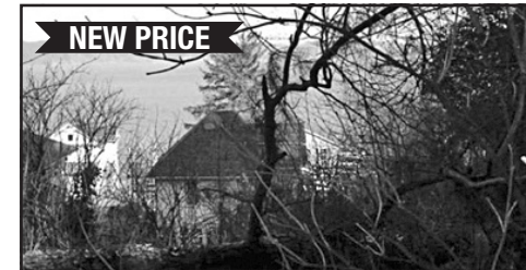
NEW PRICE WEST HILLS COLUMBIA RIVER-VIEW LOT 1st & Exchange, Astoria • $50,000

.05 acre building site in Hammond (Ft. Stevens near parade grounds), east of Quinnat. Quiet location, short distance to Ocean Beaches and Ft. Stevens State park. Opportunity knocks!