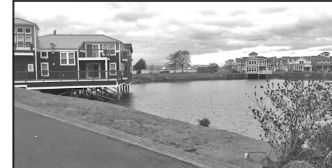
MILL POND WATER FRONT LOT Lot 11 Mill Pond Village, Astoria • 39,950

Exceptional commercial space with W. Marine Drive frontage and 11 designated off street parking spaces. The remodeled, versatile footprint offers room for expansion. This property has served as business headquarters/office space for a number of years and features large reception and staff area, meeting rooms, private offices, two half baths and a large kitchen/break room. So many possibilities!