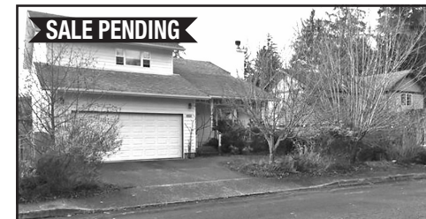
SALE PENDING CUSTOM BUILT CONTEMPORARY 253 South Street, Astoria • $349,500

Extensively renovated Surf Pines home with bonus addition featuring a large garage and full guest quarters with kitchen, bath and bedroom area and access to a private deck featuring sweeping views of the Pacific Ocean. The main level offers an open floor plan, living, dining, an updated chef's kitchen, three additional bedrooms, including private master suite, two full bathrooms. Accessory office/artists studio. Plenty of additional parking on site.