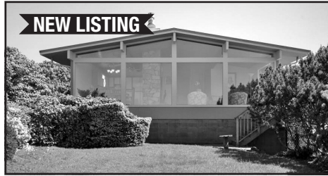
NEW LISTING BREATHTAKING RIVER AND BAY VIEWS 420 W. Lexington, Astoria • $529,000

This exceptional example of Astoria's treasured Victorians offers both a sense of history and a thoughtful renovation that merges the best of both old and new. Lovingly restored, this 2 bedroom, 2 bathroom home features a large living room and formal dining room with high ceilings and gracious ambiance. The kitchen is charming with modern utility. Spacious shop and loads of off street parking. Lovely, well-maintained yard and garden area.