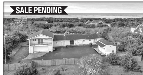
SALE PENDING SURF PINES OCEAN VIEW 89796 Sea Breeze Dr., Warrenton • $450,000

THE WOW FACTOR V/L adj. to 1786 Jerome Avenue, Astoria • $99,000 Exceptional build opportunity featuring a .17 acre site that affords panoramic views of the Columbia River, Washington Coastline, Upriver to the east and towards the Columbia River Bar to the west. Situated in Central Astoria near Astoria's Historic Downtown District, build your dream home on this one of a kind oversized lot with a million dollar view.