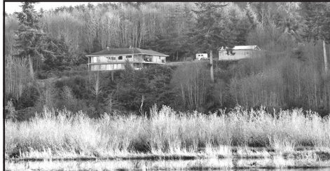
FABULOUS CUSTOM COLUMBIA RIVER WATERFRONT HOME 40481 Alton Lane, Astoria • $676,000