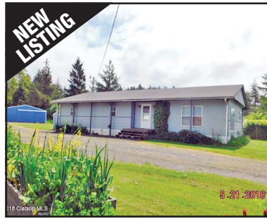
NEW LISTING 90615 Hwy 202, Astoria $199,500