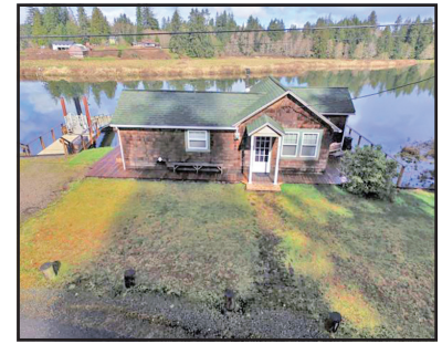
92035 John Day River Rd., Astoria $299,000