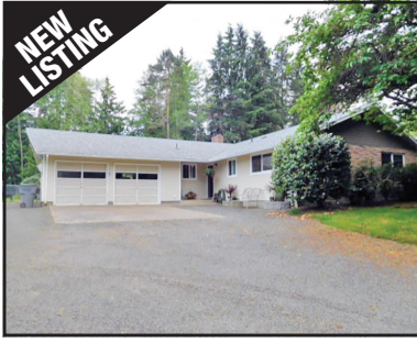
NEW LISTING 42026 Knappa Terrace Lane, Astoria $259,000