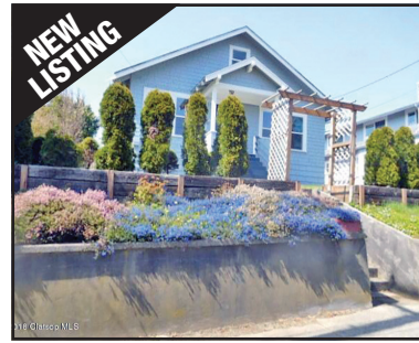
NEW LISTING 1477 7th St., Astoria $312,000