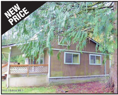
NEW PRICE 74196 Lost Creek Rd., Clatskanie $214,900