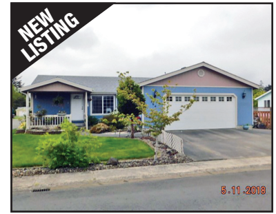
NEW LISTING 1100 NW Warrenton Dr., #364, Warrenton $93,500