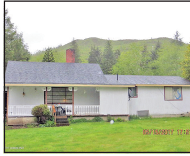
87301 Hwy 202, Astoria $250,000