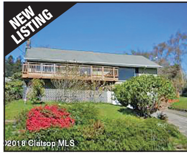
NEW LISTING 2018 Clatsop,MLS 30 Auburn Ave., Astoria $325,000