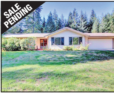
SALE PENDING 43125 Valley Creek Ln, Astoria $329,000