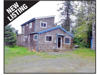
NEW LISTING 3281 N. Hwy 101, Gearhart $219,900