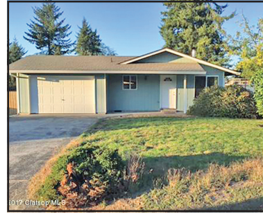
41957 Wickiup Terrace Ln., Astoria $225,000