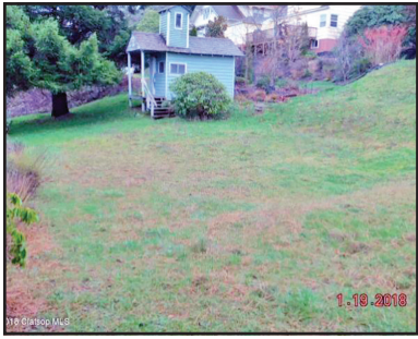
Below 794 33rd St., Astoria $55,000

A Tradition of Excellence, Trust and Service