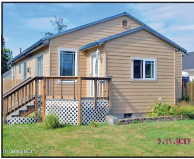
1095 Pacific Dr., Hammond $209,500