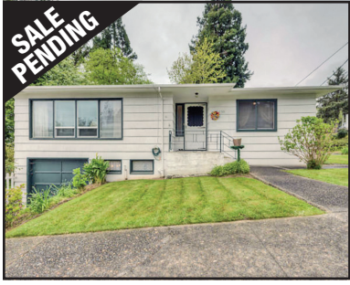
SALE PENDING 1705 7th St., Astoria $265,000