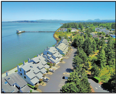
735 Point Triumph Condo #10, Hammond $395,000