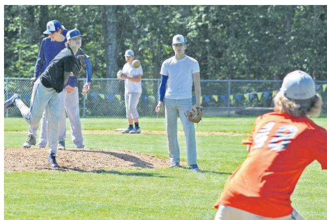
Players on the mound rehearse the pickoff attempt.

“I know they’ve been really supportive of me and the kids, and we always appreciate