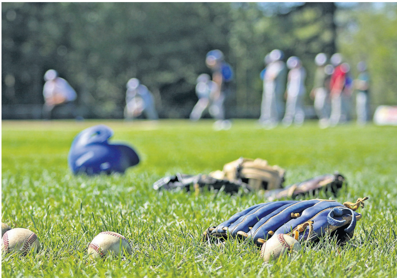
The Knappa Loggers baseball team is poised for another championship run.