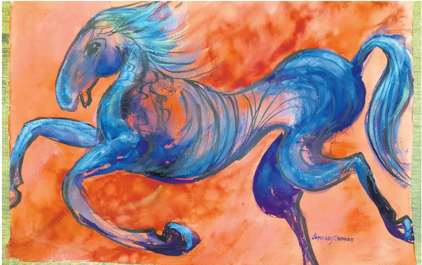
A painting by Jo Pomeroy-Crockett

But better yet, come to Cannon Beach over Memorial Day weekend, meet the artists, watch them work and check out these reasonably priced paintings.