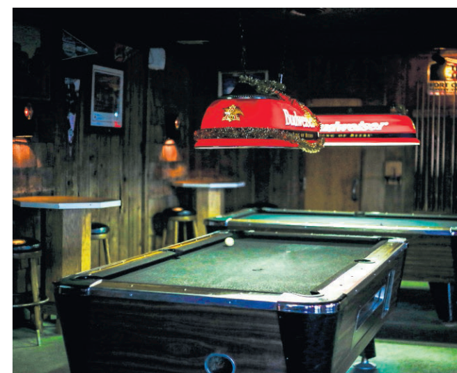
Pool tables at the Bridge Tender in Seaside