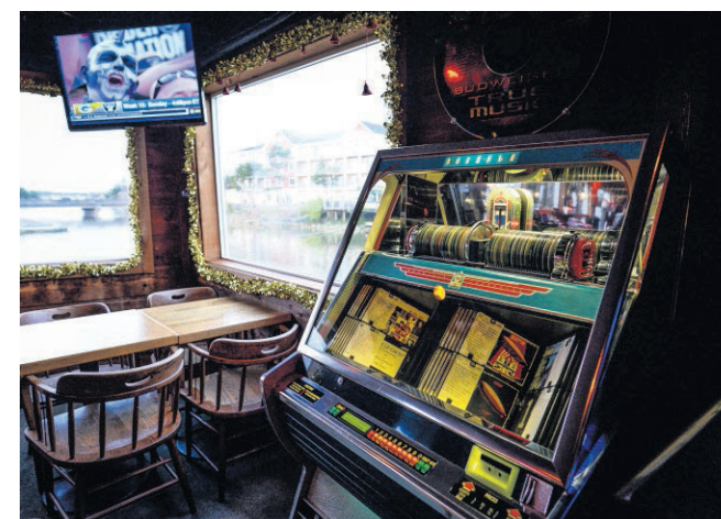
A view out of the back windows at the Bridge Tender in Seaside

—Recipe courtesy of Tiffany Kinnear, bartender at Bridge Tender, Seaside