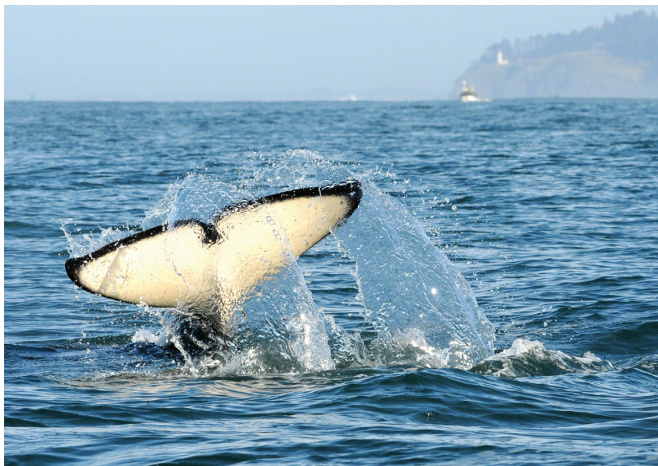
An orca splashes in the waters of the Columbia River with Cape Disappointment Lighthouse in the distance. Orcas from Puget Sound's famous J, K and L pods are frequent visitors to the mouth of the Columbia, where they hunt for Chinook salmon. Other orcas from the North Pacific Ocean also spend time here.

What drives them? Can those enormous brains discern the distant whispers of delicious fish or precisely compute the date and place of a