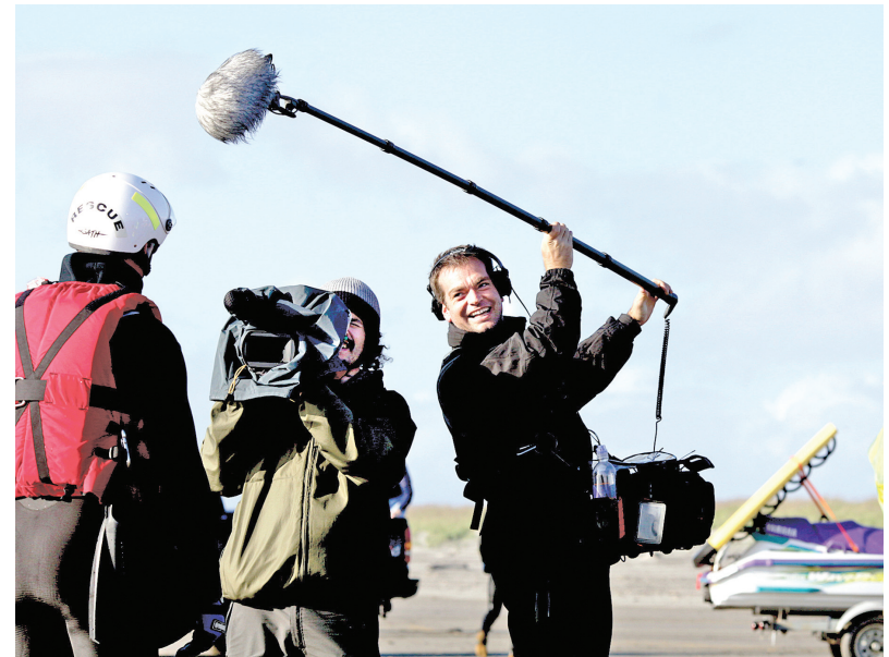
A cable TV crew taped a surf rescue training drill at the Seaview beach approach. Although local Coast Guard and volunteer lifesaving makes for dramatic stories, visitors should take care to keep out of the news by avoiding the surf and keeping an eye on younger family members who might take unnecessary risks.

Our surf can be dangerous, be sure to carefully safeguard your children in the water and never turn your back on the ocean.