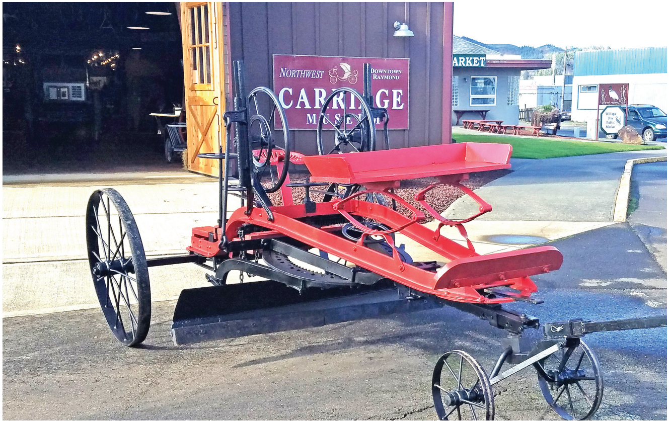
The Northwest Carriage Museum in Raymond is one of the most popular tourist attractions in Pacific County. Take time to visit it on your way to or from the beach.

The Northwest Carriage Museum is located at the junction