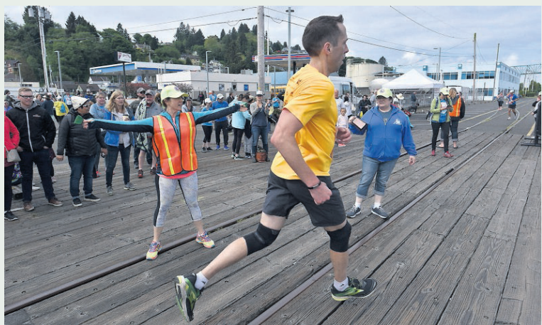
A runner makes his way along the course.