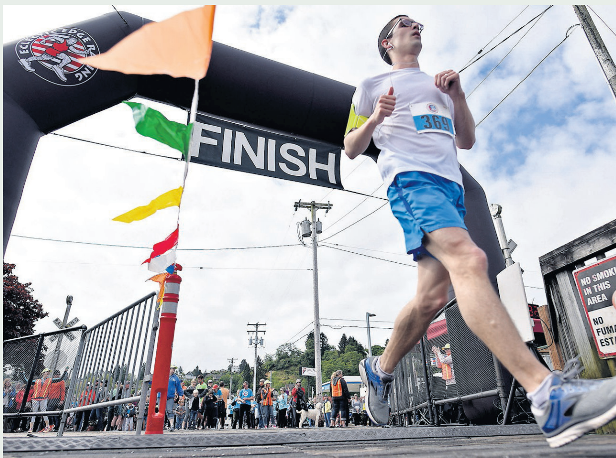
A runner crosses the finish line during the Run on the River in Astoria.