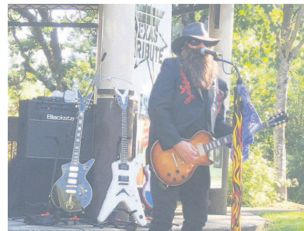
Texas Tribute plays the Liberty Theater on May 19.