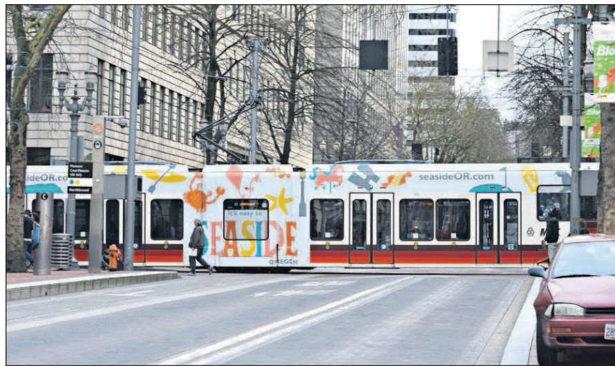
Seaside Visitors Bureau

Users vote "thumbs up" or "thumbs down" whether a destination belongs on the list.