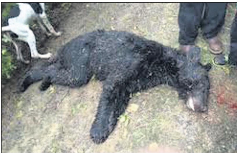
Washington Department of Fish and Wildlife