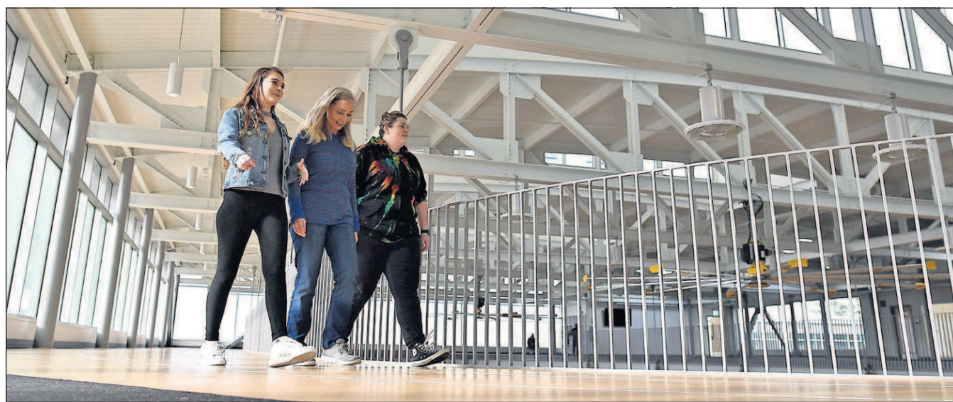
Organizers of the 'Step it Up!' program encourage family and friends of cancer survivors to participate.