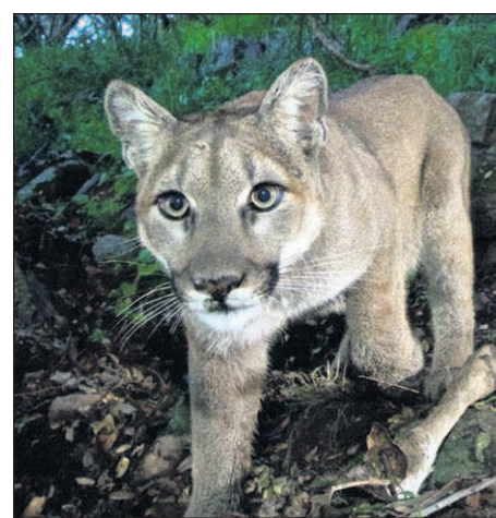
Cougar sightings have unsettled neighborhoods in Oregon this year.