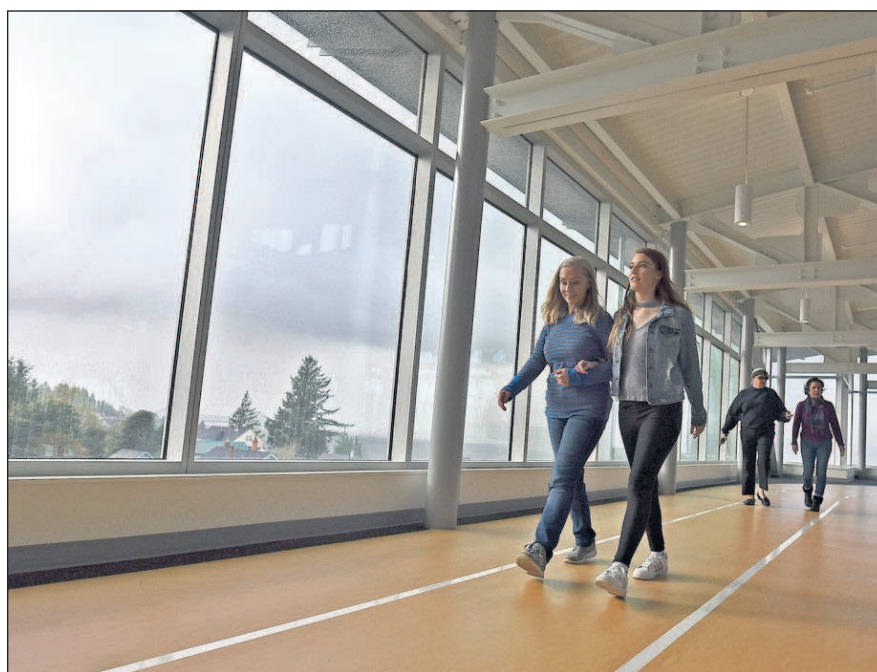
Walkers with the program — designed to support cancer survivors — admire the view from the track at Patriot Hall.