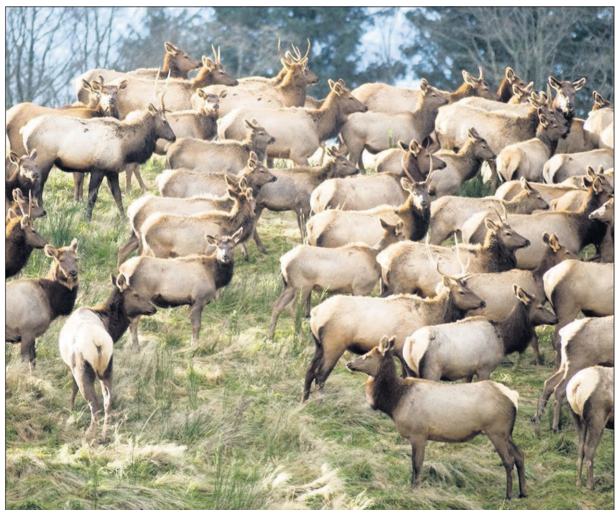
The Daily Astorian