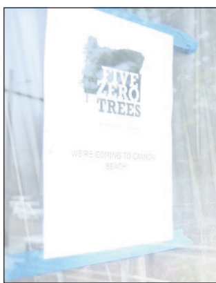
In a reversal, Cannon Beach will allow marijuana shops in mixed-use buildings.