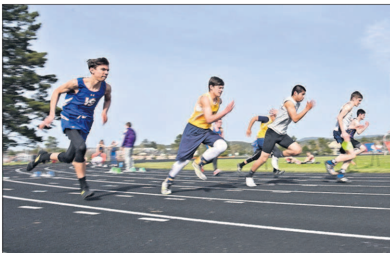
Athletes compete in the 100-meter race.

In fact, Kilday and the Gulls brought the 30th annual Daily Astorian meet to a close in just under his 7 o'clock deadline, as the