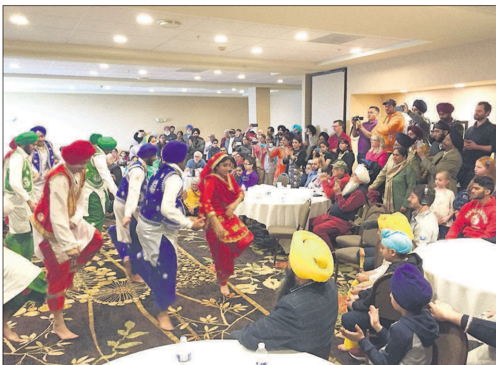
Dancers perform for Astoria residents and representatives of the regional Sikh communities at an event Saturday marking the Ghadar Party.

The event was supposed to be held outside where the