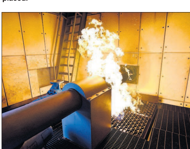
Several of the rooms in the facility are designed to mimic conditions found on ships.