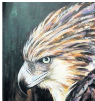
A painting of an eagle at Blue Bond Studio and Gallery