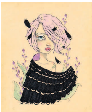
Lea Barozzi's "Changeling Girl," on display at the Starry Night Inn