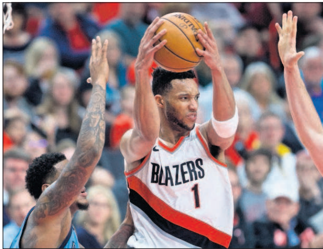
Portland Trail Blazers forward Evan Turner looks to pass the ball away from Grizzlies forward Jarell Martin.

Brooks, who played at Oregon. "That was on me, I missed two open layups."