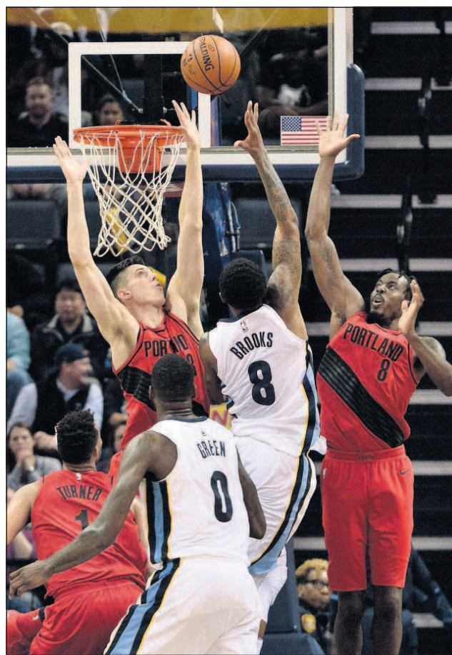
Memphis Grizzlies guard MarShon Brooks shoots between Portland Trail Blazers center Zach Collins, left, and forward Al-Farouq Aminu.

The Trail Blazers went 3 for 8 at the line in the final 7 minutes. A handful of turnovers in the fourth only made