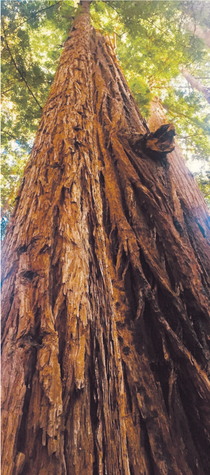
A roughly 1,000-year-old redwood

This is to say, where we live is blessed with dabs, dashes and pockets of landscape we might define as paradise. And in saying that, we must be forever reminded of our responsibility to protect those holy vistas. Those redwoods. Those Western cedars.