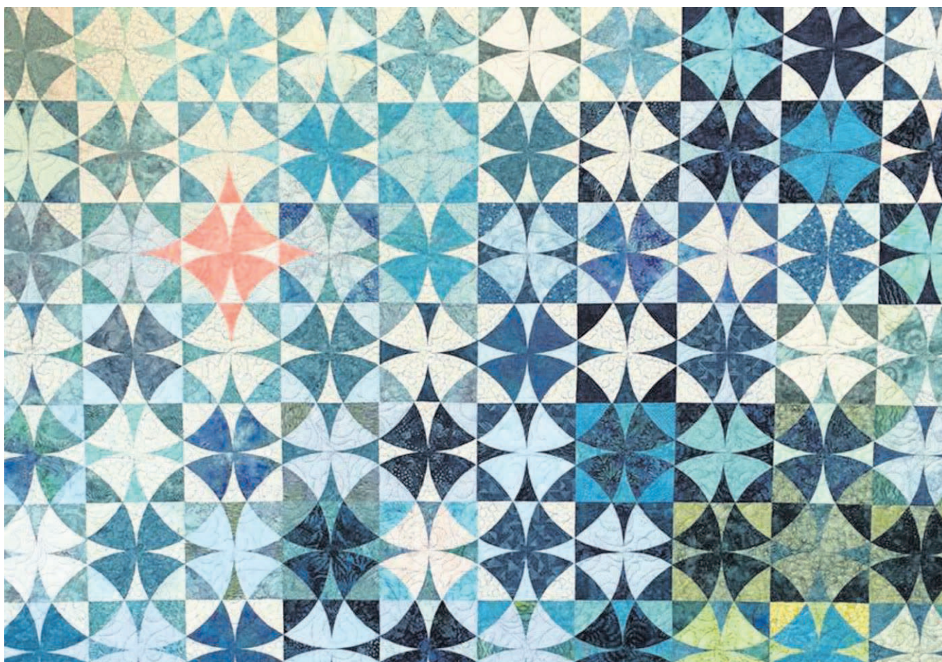
The 2018 Peninsula Quilt Guild raffle quilt

For more information, call 360-642-3446 or visit columbiapacificheritagemuseum.org .