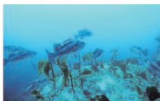
Rockfish

5 p.m., Tolovana Inn, 3400 Hemlock St., Cannon Beach, $40, 21+. Opening night kicks off with Thursday Night Throwdown featuring 12 award-winning wines to sample with chef-designed light bites; tickets available online.