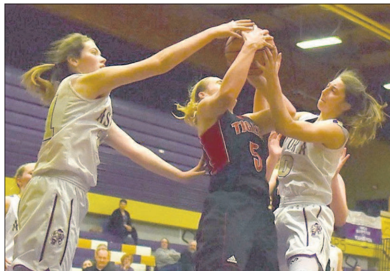
The Daily Astorian