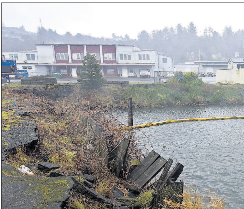
Some of the most contaminated areas lie underneath the former offices of the Port of Astoria, pictured here in the background.

Once the state makes a decision, the public can weigh in on the cleanup plan, Coates