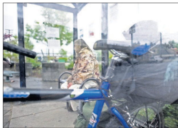
Astoria may update its code to regulate emergency homeless shelters.

The Daily Astorian • Craft3 • OSU Seafood Laboratory • KMUN-FM Cannery Pier Hotel & Spa