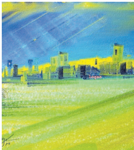
"Cityscape" by Bill Logan