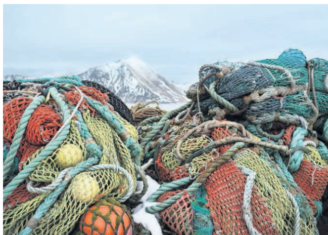
Pollock Trawl Nets in Dutch Harbor, Alaska