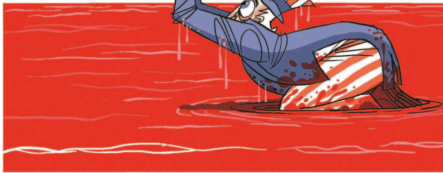
THE IDOL WORSHIPPER

FITZSIMMONS THE ASTORIA DAILY ASTORIAN CAGLE CARTOONS.COM