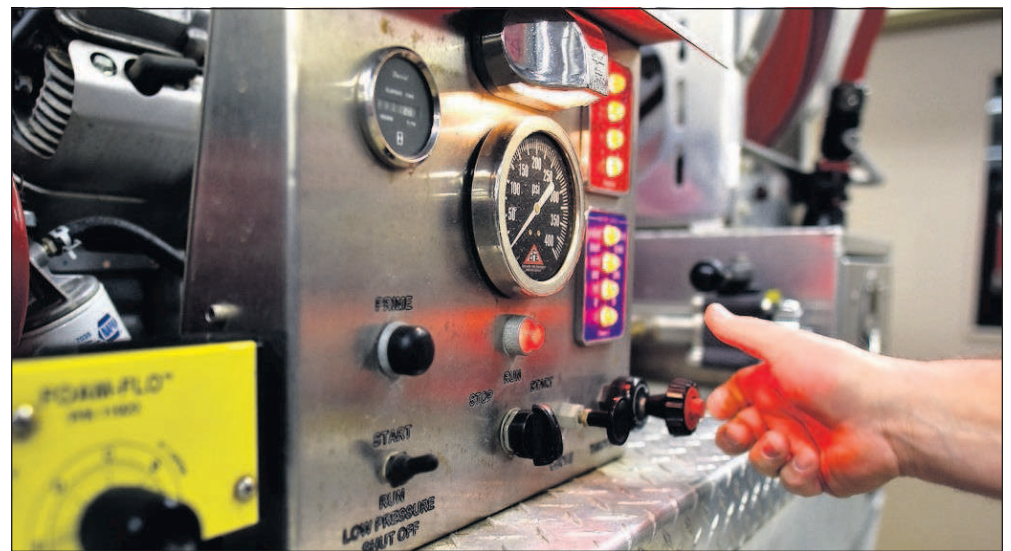
Checking equipment to ensure it is in working order is a daily task at the Cannon Beach fire department.