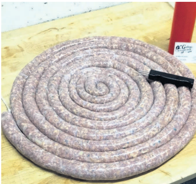
A sausage wheel

Feel free to sign up at the shop (1255 Commercial St.) or call and reserve a spot (503-325-2478).