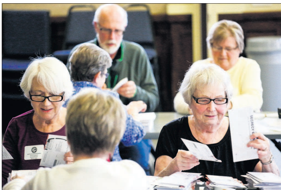
The Daily Astorian

These odd-year elections feature school boards and the Port of Astoria, which will always be featured in The