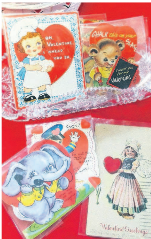
A basket and more of vintage and funny Valentines at Forgotten Treasures Antiques & Collectibles Mall