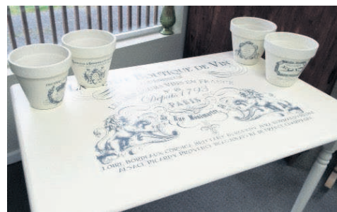
This “forgotten” table at Forgotten Treasures Antiques & Collectibles Mall has been refreshed with a coat of Dixie Belle chalk paint and delightful transfers.