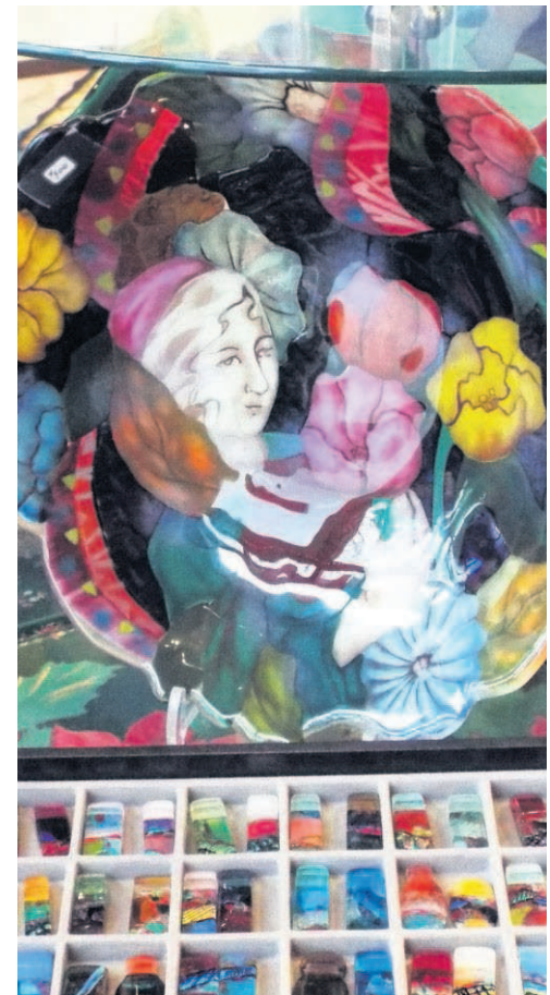
Art glass plates glow with light in Andrea Weir’s Studio. Original artwork and fine art giclée prints vie for space with beaded necklaces, fused glass pendants and beaded artwork.