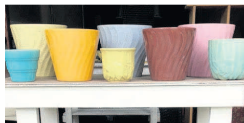
Forgotten Treasures Antiques & Collectibles Mall is home to many dealers with varying interests. Ed Strange has a wonderful collection of Bauer pottery, glass bases for Alladin lamps and painted furniture.