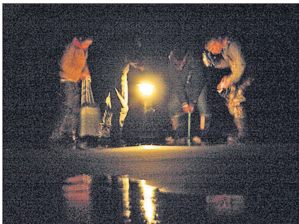
Nighttime clamming places people near the ocean's dangerous surf zone.

It may have been a sneaker wave that was responsible for last Friday's nearly simultaneous drownings on either side of the mouth of Willapa Bay. More