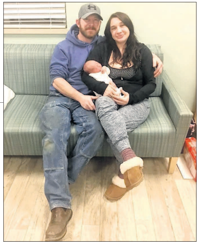
Columbia Memorial Hospital

The newest Flavin was due to be delivered by Dec.