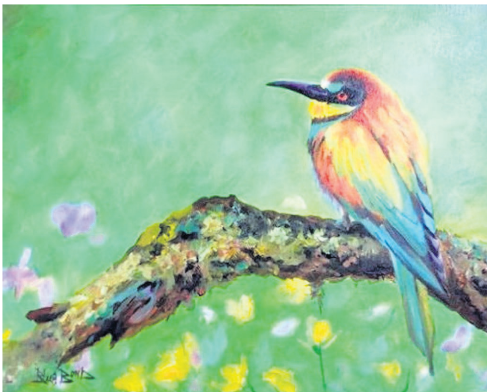
A colorful bird at Blue Bond Studio and Gallery

There are lots of paintings on the walls. It's a bit mesmerizing. His work is representational. A critic at a show he did in