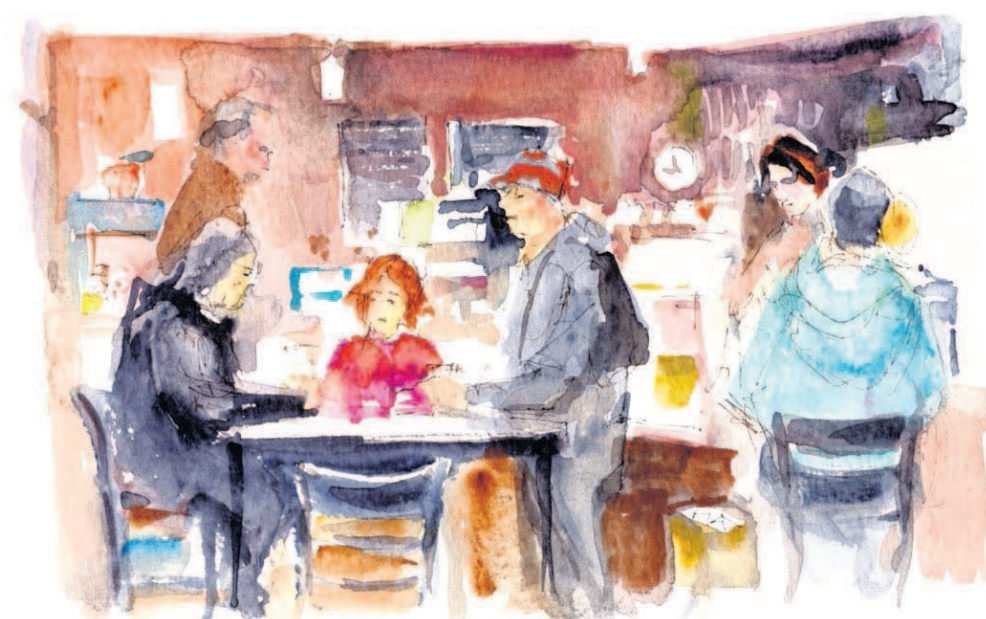
The Rusty Cup