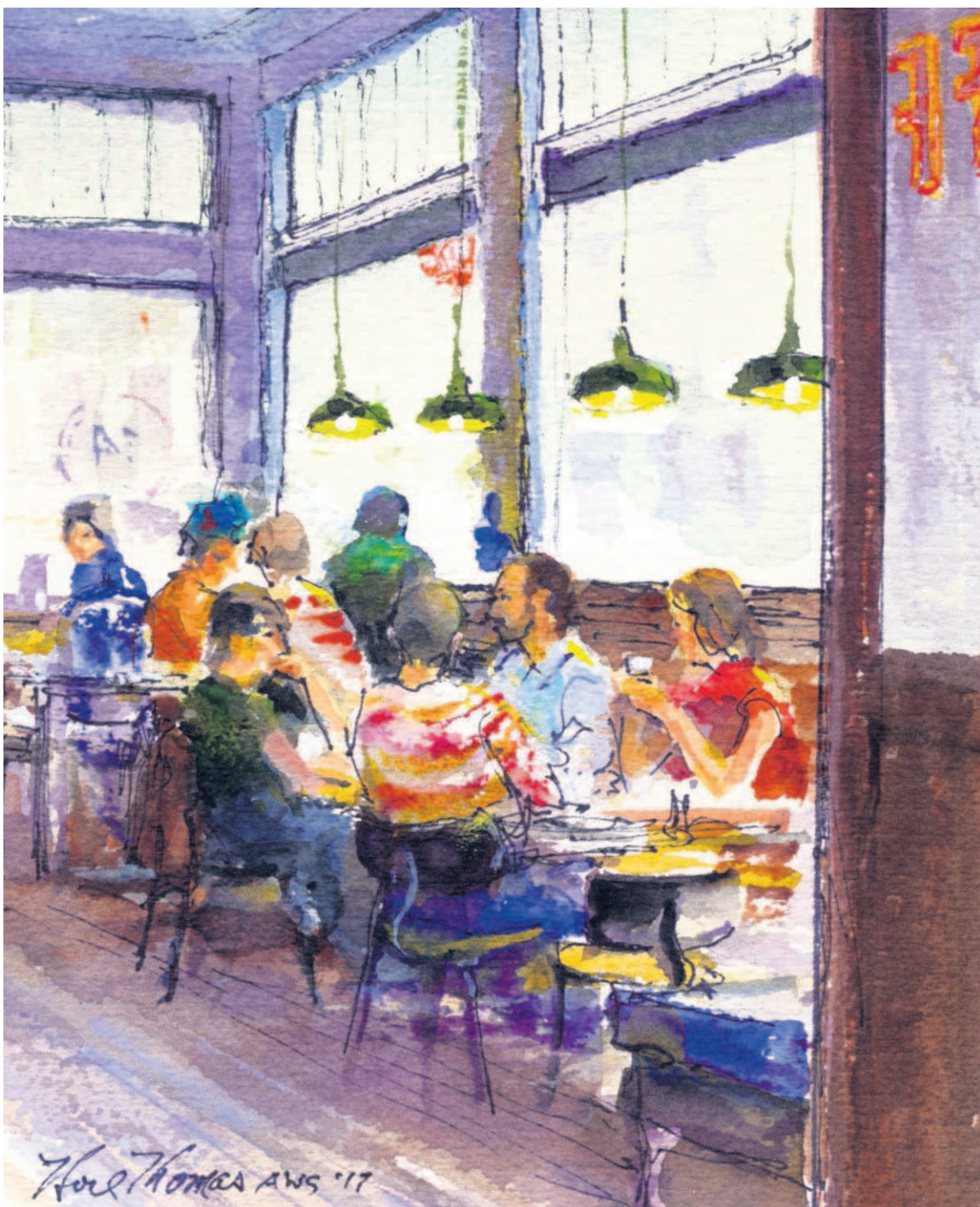
Street 14 Cafe

B rrr! It's cold and windy — the perfect time of year to get out of the weather to enjoy the many coffee places around town.