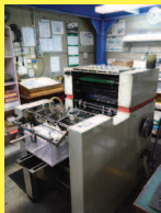
Davidson 701D one color printing press

If you want results... 74% of Clatsop County Residents read The Daily Astorian and rated Classifieds #1 for the most read section!! (From 2010 Astoria Market Study, by Marshall Marketing & Communications, Inc. Pittsburgh, PA) (503)325-3211 ext. 231 or (800)781-3211 classifieds@dailyastorian.com www.dailyastorian.com