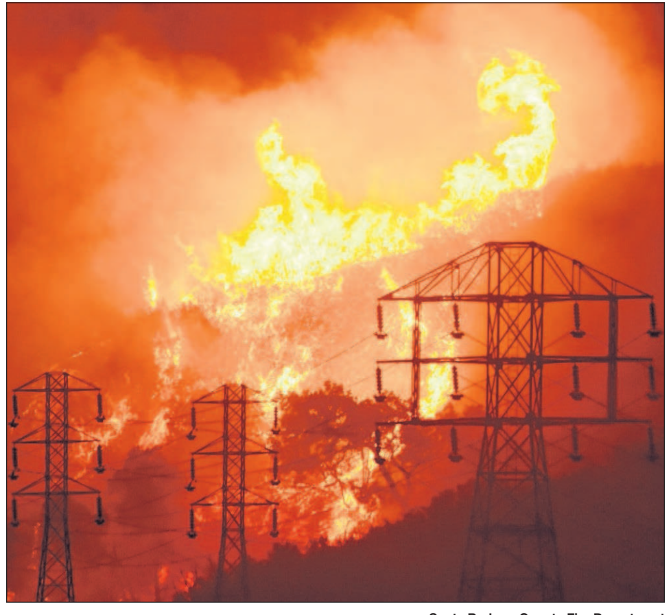
Santa Barbara County Fire Department

Flames burn near power lines Saturday in Montecito, Calif.