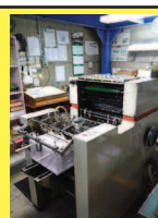
Davidson 701D one color printing press

If you want results... 74% of Clatsop County Residents read The Daily Astorian and rated Classifieds #1 for the most read section!! (From 2010 Astoria Market Study, by Marshall Marketing & Communications, Inc. Pittsburgh, PA) (503)325-3211 ext. 231 or (800)781-3211 classifieds@dailyastorian.com www.dailyastorian.com