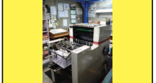
Davidson 701D one color printing press

Clean and in excellent shape. Has been running daily. New 208 ac motor. Extra supplies and parts. Services & parts manuals.