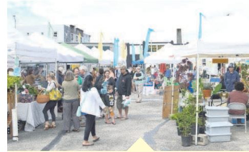
Farmers Market 2:30 p.m., North Coast Food Web, 577 18th St., Astoria, 503-468-0921. Shop for the freshest food available from local farmers and producers at the NCFW River People Farmers Market.

"A Christmas Carol" 7:30 p.m., Coaster Theatre, 108 Hemlock St., Cannon Beach, 503-436-1242, $20 to $25, rated G. Charles Dickens' "A Christmas Carol" is the classic story of old miser Ebenezer Scrooge, who is visited by ghostly spirits.