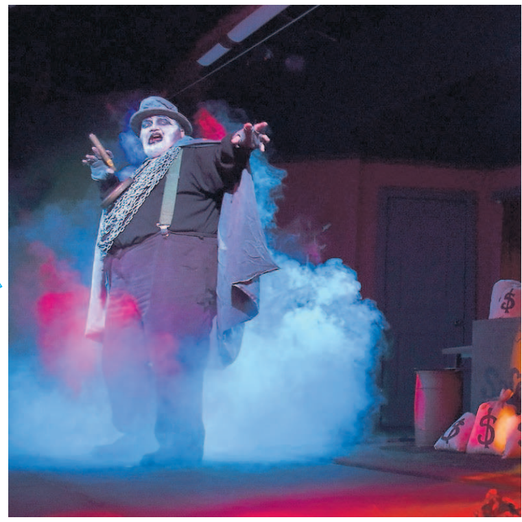
Performers in the Astor Street Opry Company's production of "Scrooged in Astoria" rehearse a scene.

"Scrooged in Astoria" 7 p.m., Astor Street Opry Company, 129 Bond St., Astoria, 503-325-6104, $5. A melodrama adaptation of the classic "A Christmas Story," combines holiday tunes with Scandinavian traditions.