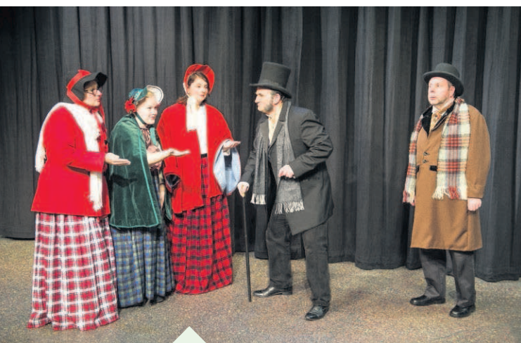
Ebenezer Scrooge confronts carolers while Bob Cratchit watches on.

Christmas Dinner Noon, Astoria Senior Center, 1111 Exchange St., Astoria, 503-325-3231, $5 to $15.