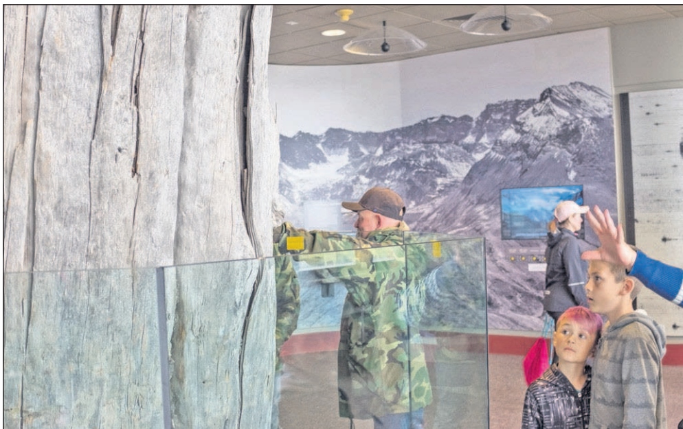
Long Beach, Washington, fourth graders view a large tree trunk left behind during the Mount St. Helens eruption in 1980 at the Johnston Ridge Observatory during their class trip this year.

In 1982, a temporary pumping station was installed to lower water levels. This was followed by construction of the tunnel to divert water into South Coldwater Creek.