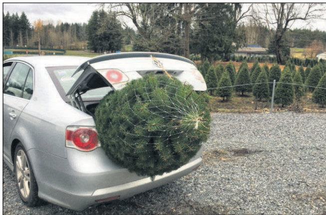
Northwest News Network

There are many reasons for the shortage: For one, weather. There have been two years of summer drought and an exceptionally wet spring this year