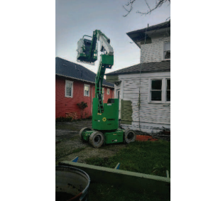
2006 JLG Articulated Boom Lift New batteries In Astoria Asking $14.5k (503)506-8888

SHOP LOCAL! Check the Business Directory daily to utilize the local professionals advertising in The Daily Astorian. To place an ad in our Business Directory, call 503-325-3211.