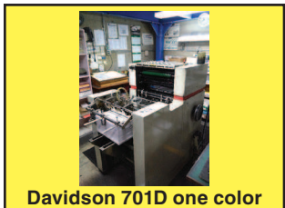
Davidson 701D one color printing press

Clean and in excellent shape. Has been running daily. New 208 ac motor. Extra supplies and parts. Services & parts manuals.