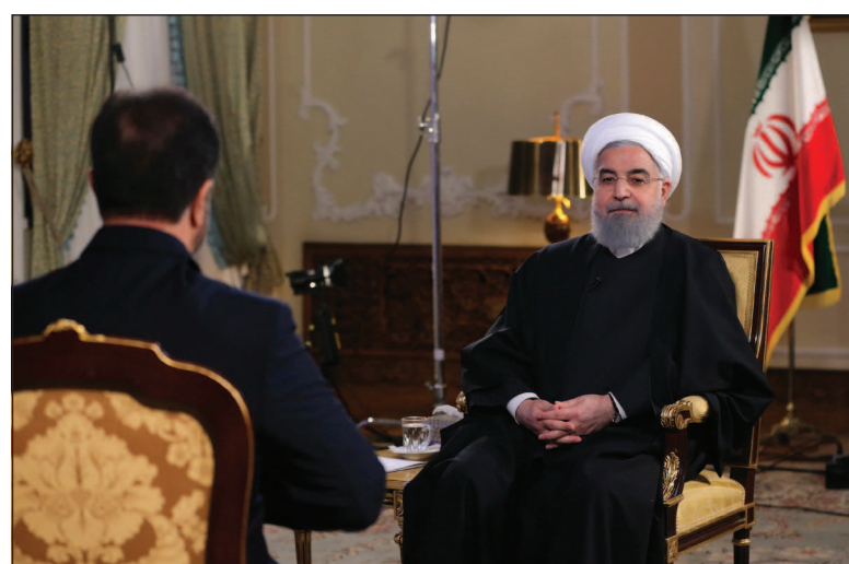
Iranian President Hassan Rouhani, right, said in a recent television interview that Saudi Arabia's revamped enmity toward Tehran is a cover-up for the kingdom's domestic and regional failures.

For starters, American, European and Arab leaders should all be encouraging MBS to keep going where no Saudi leader before him has dared to go — pursuing his stated goal of reversing the religious right turn that the kingdom took in 1979, after the takeover of the