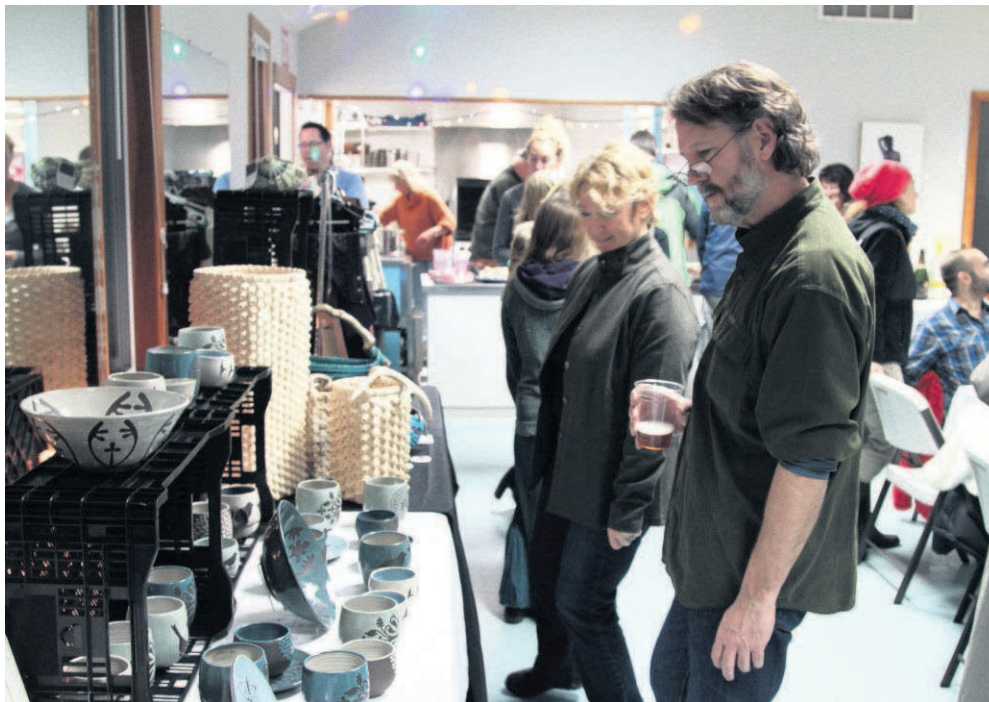
Guests peruse items at the Tolovana Arts Colony's 2016 Holiday Gift Bazaar.

The bazaar continues through the weekend, open 11 a.m. to 3 p.m. Saturday, Dec. 9, and Sunday, Dec. 10. But remember: Some of these are one-of-a-kind items and many will be scooped up quick.